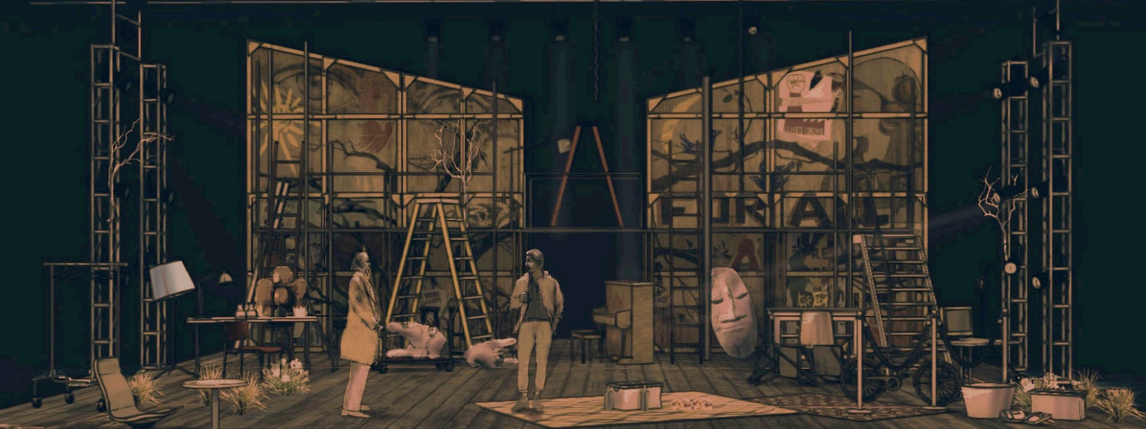
Used two castered wagon sets to sharply contrast the court and Arden, supporting clear spatial storytelling.