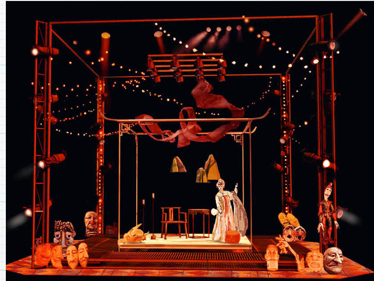
THE CHINESE LADY 2026

Designed a small, hand-turned turntable to solve round stage challenges and enhance storytelling through actor-controlled movement.