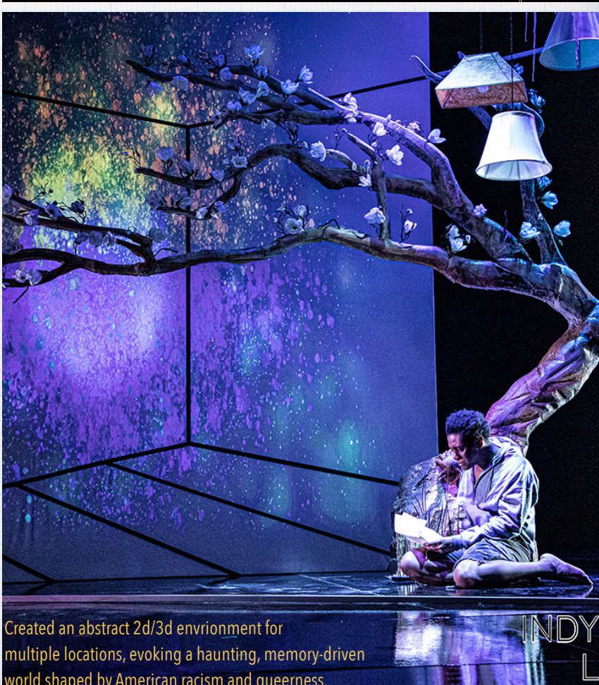
Created an abstract 2d/3d environment for multiple locations, evoking a haunting, memory-driven world shaped by American racism and queerness.