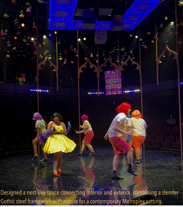
Designed a nest-like space connecting interior and exterior, combining a slender Gothic steel framework with nature for a contemporary Metroplex setting.