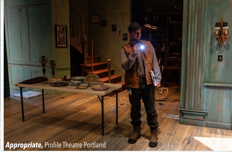
Appropriate , Profile Theatre Portland