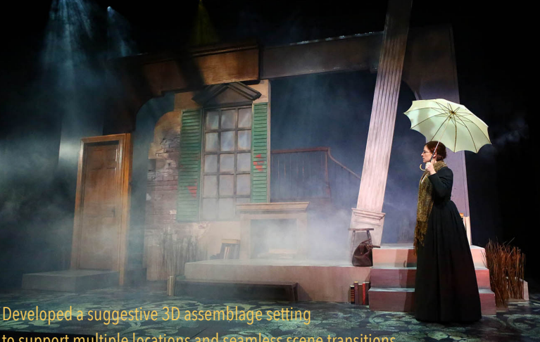
Developed a suggestive 3D assemblage setting to support multiple locations and seamless scene transitions.