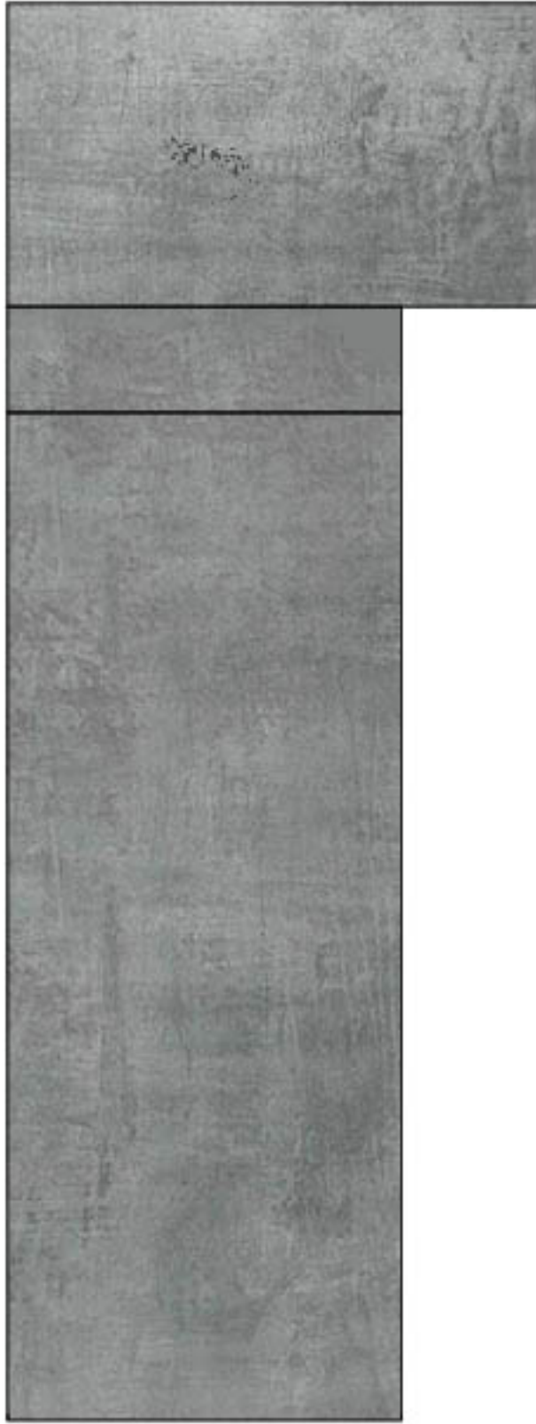
A-1 platform SR